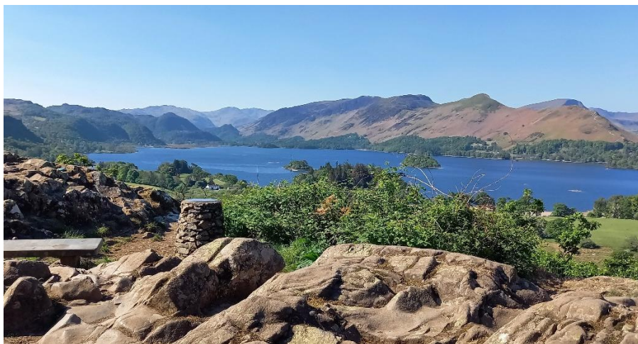
Derwentwater from Castle Head