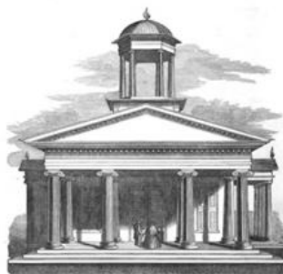
English and Chinese Church at Tientsin