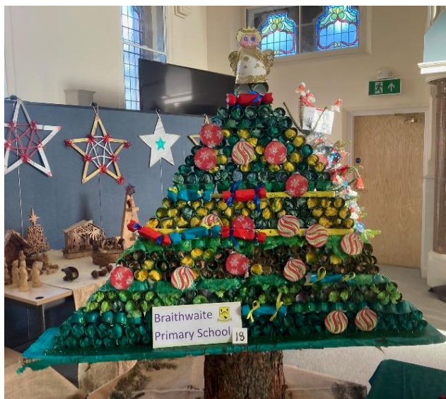
Most popular Christmas Tree

Not quite as much as last year but still a very good outcome.