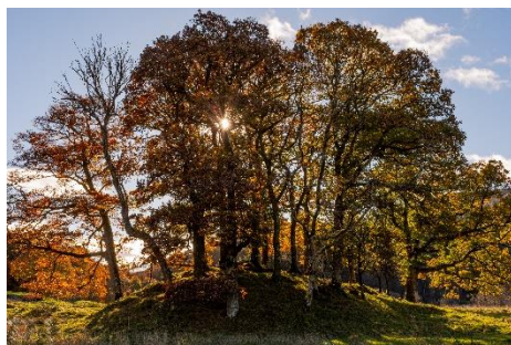
Mound of trees at Elterwater