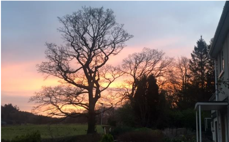
Sunrise through the trees from our front door

This one speaks for itself. But not only does it bring the hope of a brand new day. It reveals the beautiful shape and patterns of the sunlight through the bare branches of the trees.