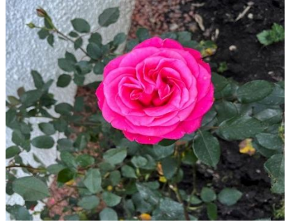
a lovely smelling rose