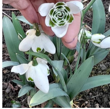
A double snowdrop

Recently I visited a National Trust house and garden, Anglesey Abbey, which is near Cambridge. One of the main attractions was the Snowdrop Collection which consists of about 400 varieties, a few of which are still not named. A few days earlier apparently, a knowledgeable visitor had spotted a totally new variety!