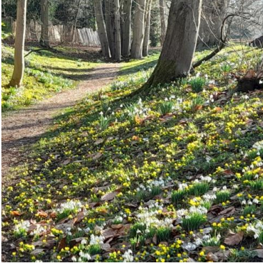
Part of the original collection